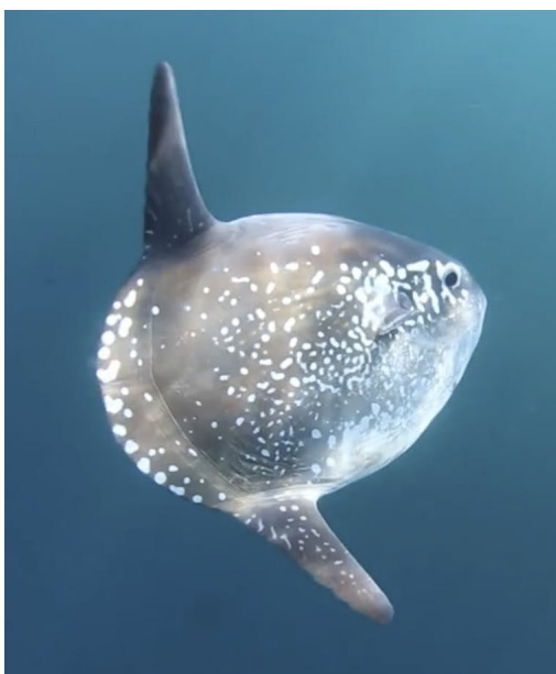
A hoodwinker sunfish off the coast of Chile. What is the

I flew down to Christchurch, landed at night and drove out on to the beach. I saw my first hoodwinker sunfish in the headlights of the car – it was incredibly exciting. This changed everything, because now we knew what we were looking for.