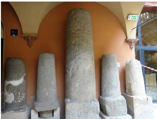
Roman Milestones in the Bologna Archaeological Museum.

Augustus’ right-hand man, Agrippa, displayed a map of the world in his portico at Rome which contained lists of distances and measurements of regions, probably compiled from Roman roads.