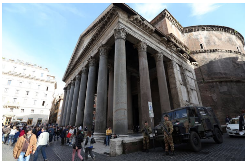
The Pantheon was Agrippa’s temple to the pagan gods.