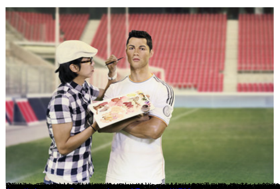
ethild and a service and the small of the service service the first Kong