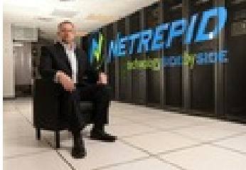
Netrepid Virtual Incubator